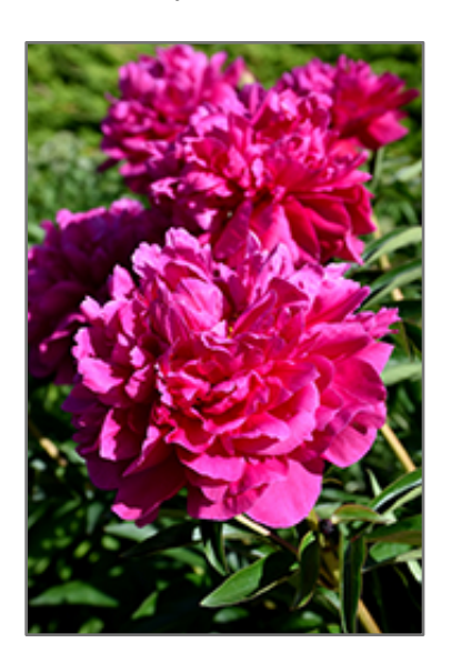
Kansas Peony flowers