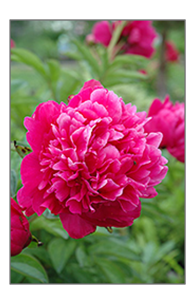
Kansas Peony flowers