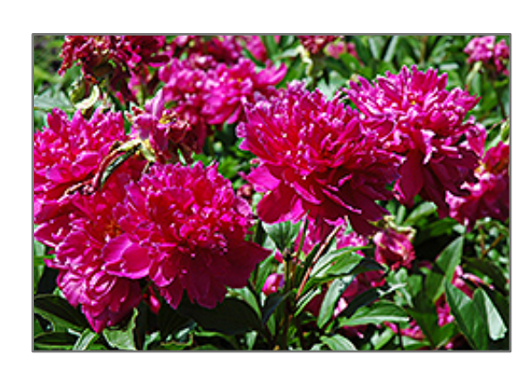
Karl Rosenfield Peony flowers

Karl Rosenfield Peony features bold lightly-scented fuchsia flowers with yellow anthers at the ends of the stems from late spring to early summer. The flowers are excellent for cutting. Its compound leaves remain green in colour throughout the season.