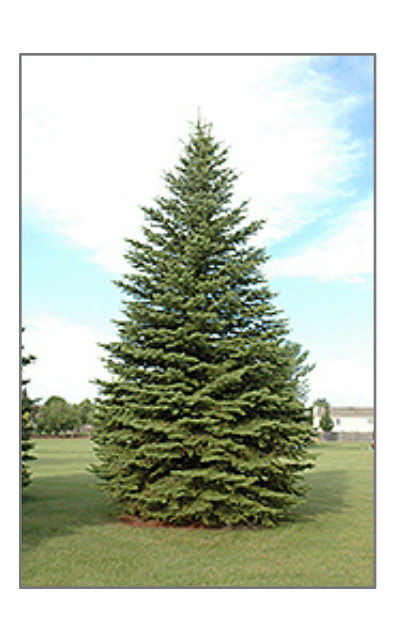
Colorado Spruce

Colorado Spruce is primarily valued in the landscape for its distinctively pyramidal habit of growth. It has rich green evergreen foliage which emerges bluish-green in spring. The needles remain green throughout the winter. The rough gray bark adds an interesting dimension to the landscape.