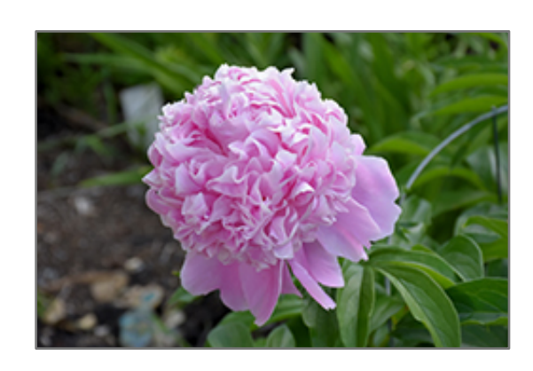
Sarah Bernhardt Peony flowers

Sarah Bernhardt Peony features bold fragrant shell pink flowers at the ends of the stems from late spring to early summer. The flowers are excellent for cutting. Its compound leaves remain green in colour throughout the season.