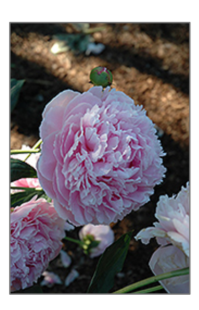
Shirley Temple Peony flowers

Shirley Temple Peony features bold lightly-scented white cup-shaped flowers with shell pink overtones and pink centers at the ends of the stems from late spring to early summer. The flowers are excellent for cutting. Its compound leaves remain green in colour throughout the season.