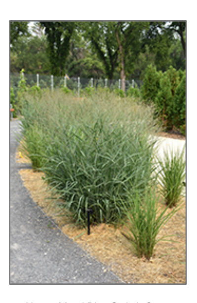
Heavy Metal Blue Switch Grass