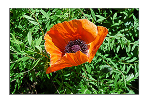
Oriental Poppy flowers