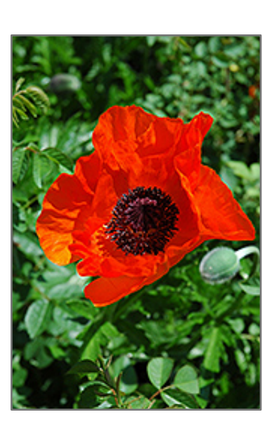
Allegro Poppy flowers

Allegro Poppy features bold tomato-orange round flowers with burgundy eyes at the ends of the stems from early to mid summer. The flowers are excellent for cutting. Its deeply cut ferny leaves remain forest green in colour throughout the season.