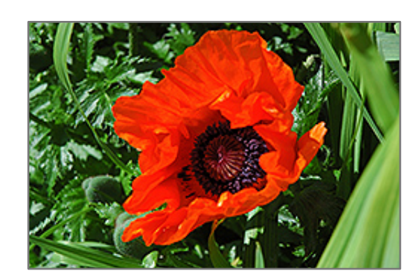
Garden Glory Poppy flowers