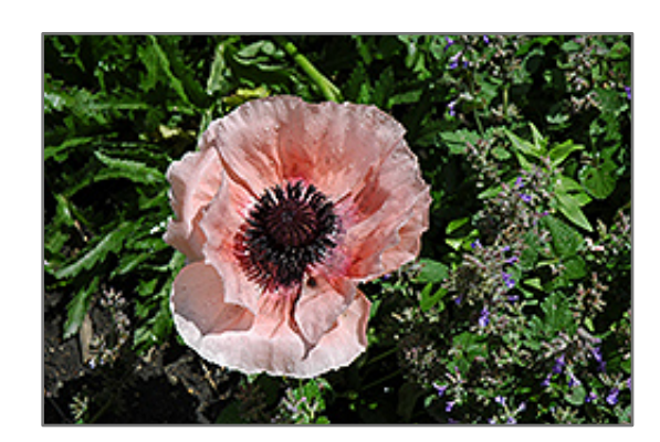
Watermelon Poppy flowers