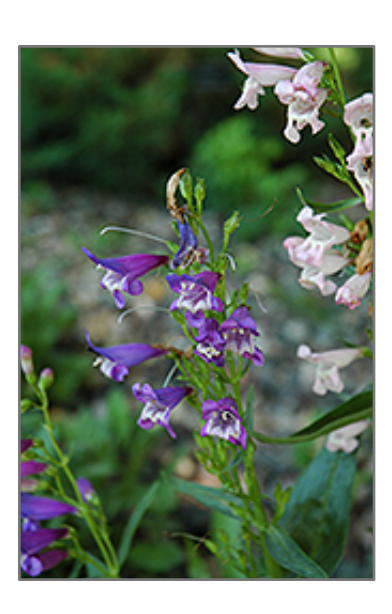
Rondo Mix Beard Tongue flowers

Rondo Mix Beard Tongue has masses of beautiful spikes of violet tubular flowers with white throats rising above the foliage from late spring to mid summer, which are most effective when planted in groupings. The flowers are excellent for cutting. Its narrow leaves remain green in colour throughout the season.