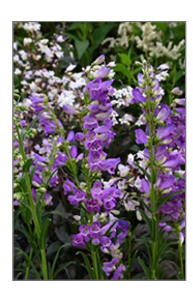
Prairie Dusk Beard Tongue flowers

Prairie Dusk Beard Tongue has masses of beautiful spikes of lilac purple tubular flowers rising above the foliage from early to mid summer, which are most effective when planted in groupings. The flowers are excellent for cutting. Its narrow leaves remain green in colour throughout the season.