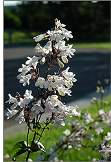
Husker Red Beard Tongue flowers