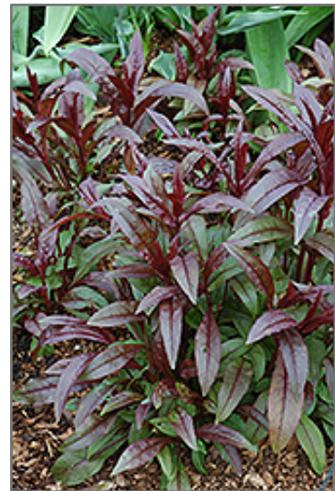
Husker Red Beard Tongue foliage