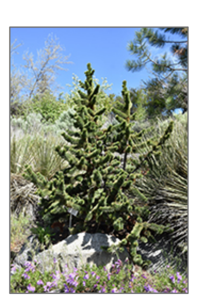
Bristlecone Pine

An interesting small evergreen tree with stark, stout branches and short needles; rather open appearance, a character tree, good for accent use in the garden; extremely long lived and slow growing, some living specimens are over 4,500 years old