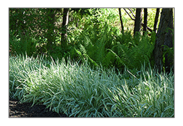
Variegated Ribbon Grass foliage