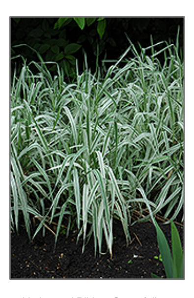
Variegated Ribbon Grass foliage