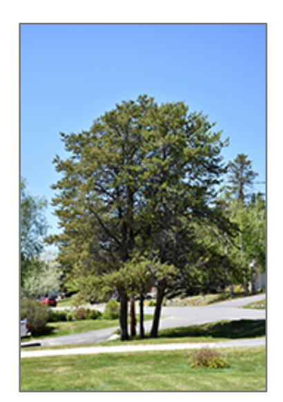
Jack Pine