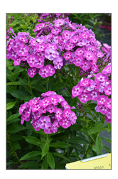
Laura Garden Phlox flowers

Laura Garden Phlox features bold fragrant conical lilac purple star-shaped flowers with white eyes at the ends of the stems from early summer to early fall. The flowers are excellent for cutting. Its narrow leaves remain green in colour throughout the season.