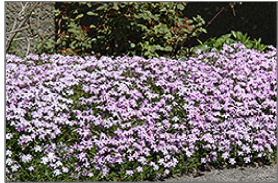
Emerald Blue Moss Phlox in bloom

Emerald Blue Moss Phlox will grow to be only 4 inches tall at maturity, with a spread of 18 inches. When grown in masses or used as a bedding plant, individual plants should be spaced approximately 15 inches apart. Its foliage tends to remain low and dense right to the ground. It grows at a medium rate, and under ideal conditions can be expected to live for approximately 10 years. As an evergreen perennial, this plant will typically keep its form and foliage year-round.