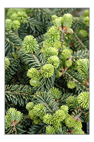
Dwarf Balsam Fir foliage