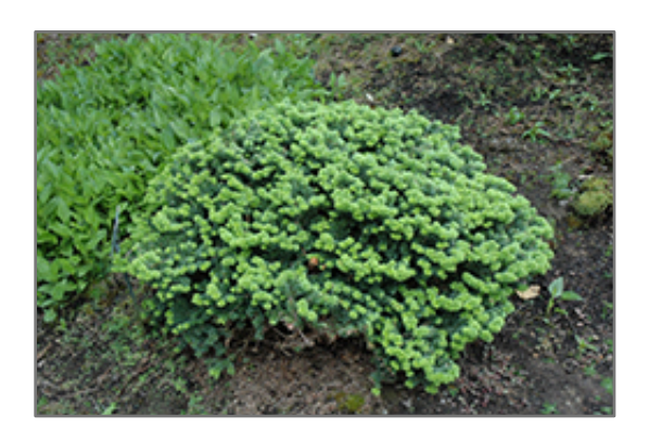
Dwarf Balsam Fir

Dwarf Balsam Fir will grow to be about 24 inches tall at maturity, with a spread of 3 feet. It tends to fill out right to the ground and therefore doesn't necessarily require facer plants in front. It grows at a slow rate, and under ideal conditions can be expected to live for 50 years or more.