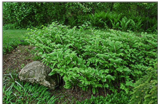
Variegated Solomon's Seal in bloom