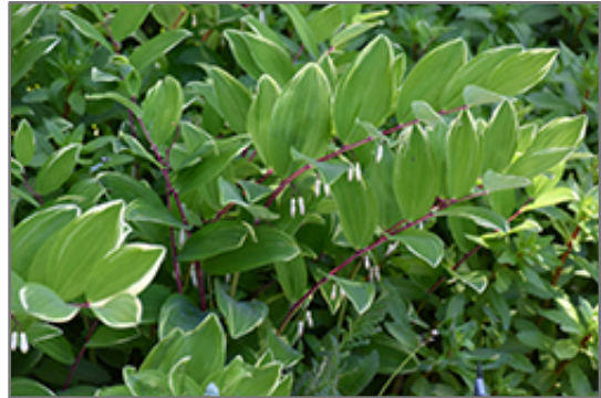
Variegated Solomon's Seal flowers