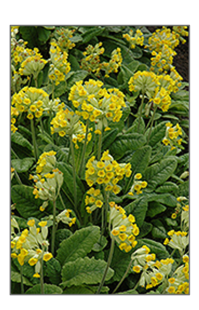
English Cowslip flowers

English Cowslip features delicate panicles of lightly-scented yellow tubular flowers with tan sheaths at the ends of the stems in early spring. Its small serrated oval leaves remain green in colour throughout the season.