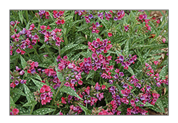
Raspberry Splash Lungwort flowers