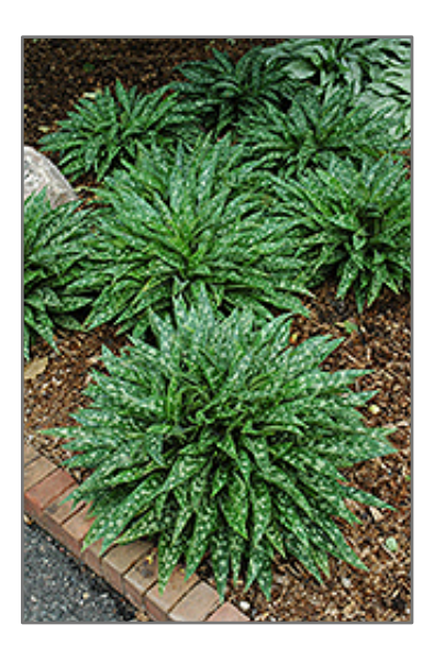
Raspberry Splash Lungwort