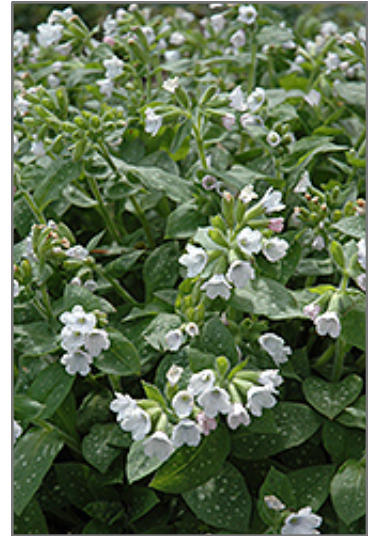
Sissinghurst White Lungwort flowers