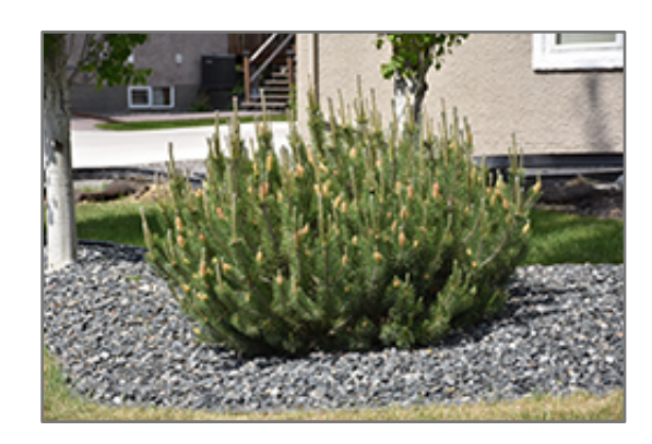
Mugo Pine

An extremely hardy and adaptable evergreen, this is actually a highly variable species, almost no two are alike, ranging from small garden detail shrubs to tall, wide trees; many specific cultivars are available, needs full sun