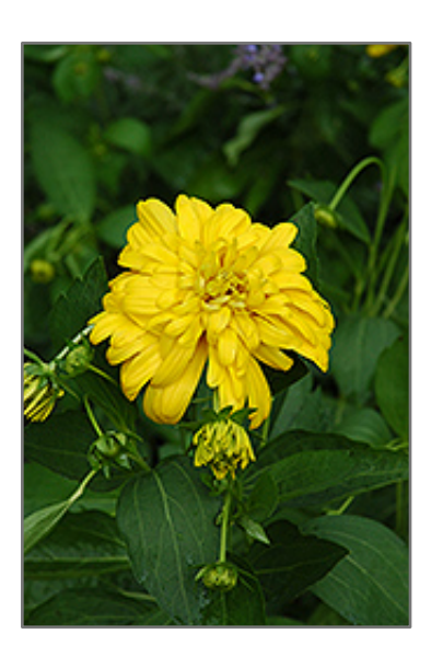
Goldquelle Coneflower flowers

Goldquelle Coneflower has masses of beautiful yellow daisy flowers at the ends of the stems from mid summer to early fall, which are most effective when planted in groupings. The flowers are excellent for cutting. Its serrated pointy leaves remain dark green in colour throughout the season.