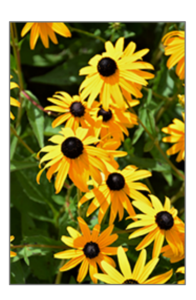
Goldsturm Coneflower flowers