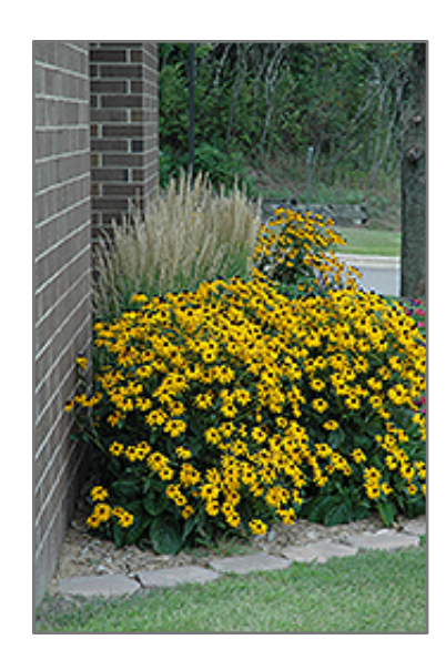
Goldsturm Coneflower in bloom