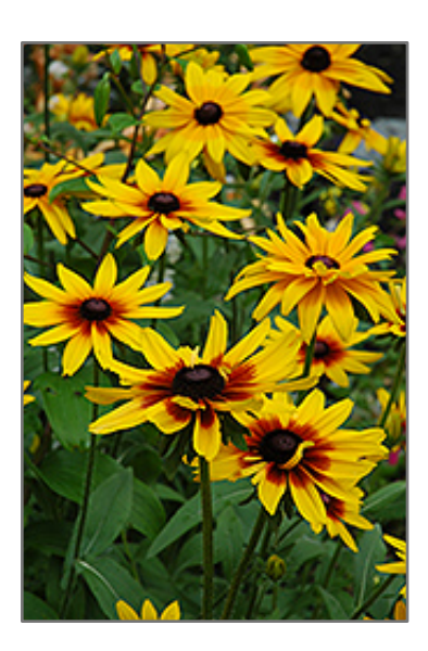
Becky Coneflower flowers

Becky Coneflower has masses of beautiful gold daisy flowers with dark brown eyes and antique red centers at the ends of the stems from mid summer to late fall, which are most effective when planted in groupings. The flowers are excellent for cutting. Its serrated pointy leaves remain green in colour throughout the season.