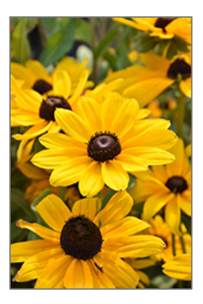
Indian Summer Coneflower flowers

Indian Summer Coneflower has masses of beautiful gold daisy flowers with dark brown eyes at the ends of the stems from mid summer to late fall, which are most effective when planted in groupings. The flowers are excellent for cutting. Its serrated pointy leaves remain green in colour throughout the season.