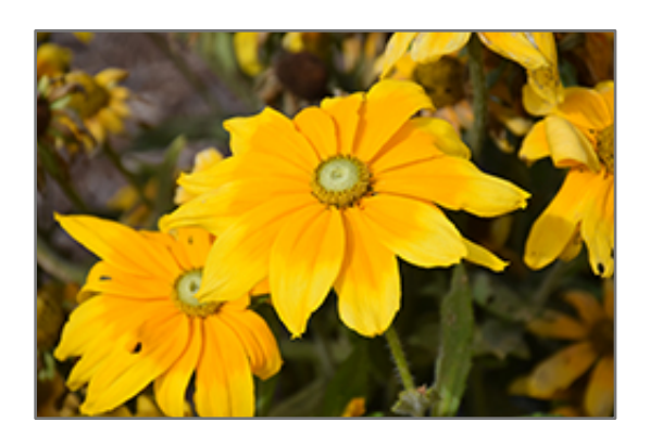
Prairie Sun Coneflower flowers

Prairie Sun Coneflower is recommended for the following landscape applications;