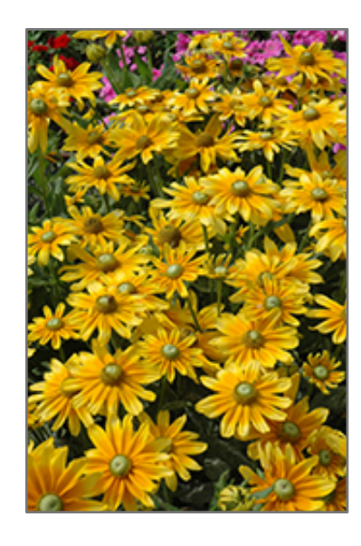
Prairie Sun Coneflower flowers

This is a relatively low maintenance plant, and should be cut back in late fall in preparation for winter. It is a good choice for attracting butterflies to your yard, but is not particularly attractive to deer who tend to leave it alone in favor of tastier treats. It has no significant negative characteristics.