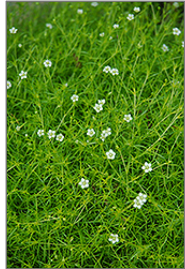
Scotch Moss flowers