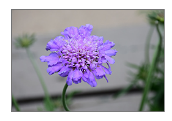
Butterfly Blue Pincushion Flower flowers

This is a relatively low maintenance plant, and should be cut back in late fall in preparation for winter. It is a good choice for attracting bees and butterflies to your yard, but is not particularly attractive to deer who tend to leave it alone in favor of tastier treats. It has no significant negative characteristics.