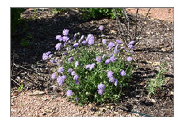
Butterfly Blue Pincushion Flower in bloom

Butterfly Blue Pincushion Flower is recommended for the following landscape applications;