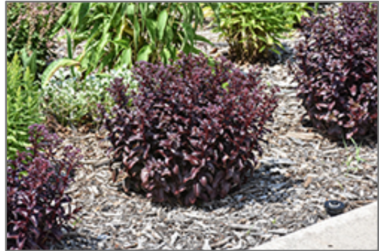
Dark Magic Stonecrop in bloom

Dark Magic Stonecrop will grow to be about 12 inches tall at maturity, with a spread of 20 inches. When grown in masses or used as a bedding plant, individual plants should be spaced approximately 16 inches apart. It grows at a fast rate, and under ideal conditions can be expected to live for approximately 15 years. As an herbaceous perennial, this plant will usually die back to the crown each winter, and will regrow from the base each spring. Be careful not to disturb the crown in late winter when it may not be readily seen!