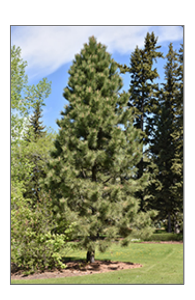
Yellow Pine