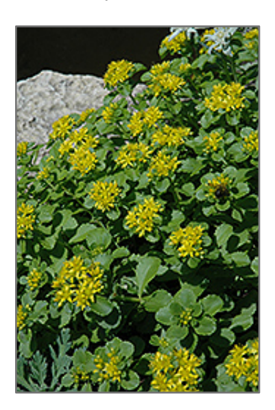
Russian Stonecrop flowers