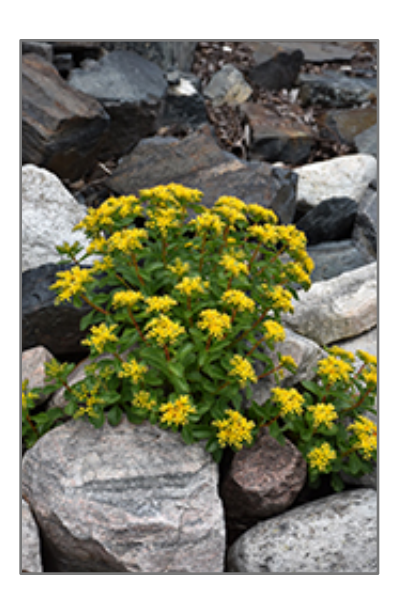
Russian Stonecrop in bloom