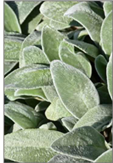
Lamb's Ears foliage

Lamb's Ears is recommended for the following landscape applications;