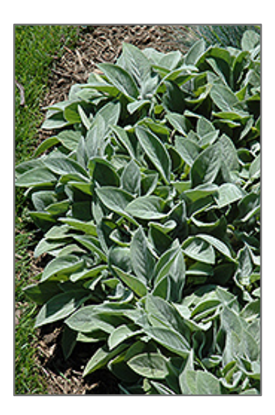
Giant Lamb's Ears