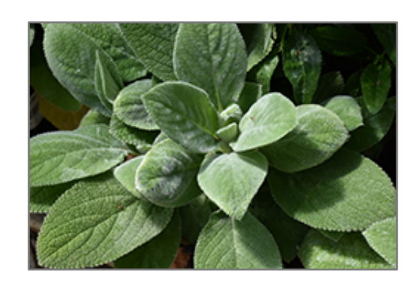
Giant Lamb's Ears foliage

Giant Lamb's Ears is recommended for the following landscape applications;