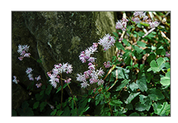
Dwarf Korean Meadow Rue flowers