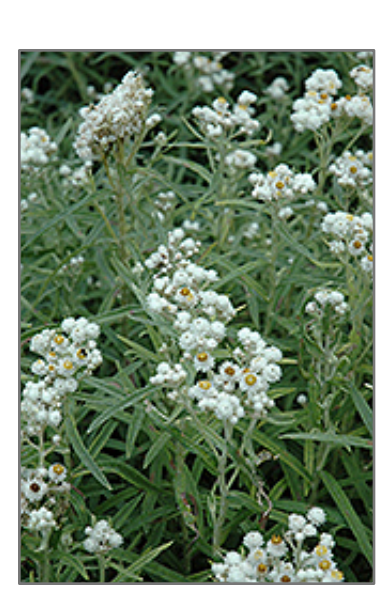
Pearly Everlasting flowers

Pearly Everlasting has masses of beautiful white button flowers with yellow eyes at the ends of the stems from early summer to early fall, which are most effective when planted in groupings. The flowers are excellent for cutting. Its attractive tomentose narrow leaves remain grayish green in colour with hints of silver throughout the season.