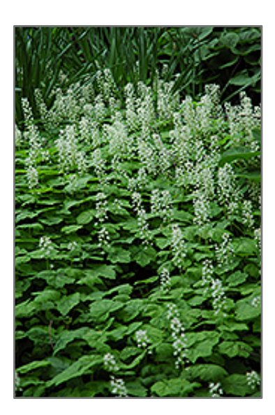
Creeping Foamflower in bloom