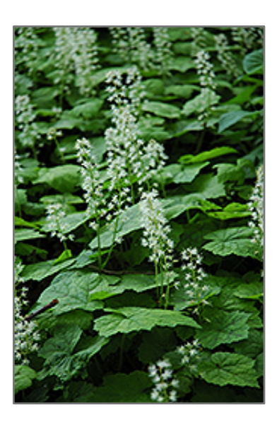
Creeping Foamflower flowers