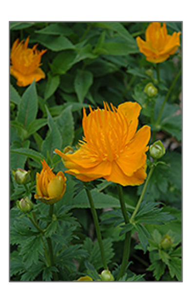
Golden Queen Globeflower flowers

Golden Queen Globeflower has masses of beautiful gold buttercup flowers with orange anthers at the ends of the stems from late spring to early summer, which are most effective when planted in groupings. The flowers are excellent for cutting. Its deeply cut lobed leaves remain dark green in colour throughout the season.