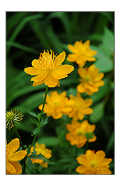
Globeflower flowers

Globeflower has masses of beautiful gold buttercup flowers with orange anthers at the ends of the stems from late spring to early summer, which are most effective when planted in groupings. The flowers are excellent for cutting. Its deeply cut lobed leaves remain dark green in colour throughout the season.