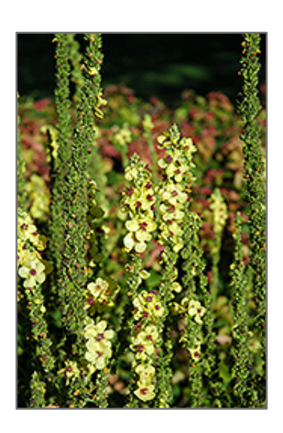
Turkish Mullein flowers

Turkish Mullein has masses of beautiful spikes of lemon yellow flowers with burgundy anthers rising above the foliage from late spring to late summer, which are most effective when planted in groupings. The flowers are excellent for cutting. Its attractive tomentose round leaves emerge silver in spring, turning gray in colour throughout the season.