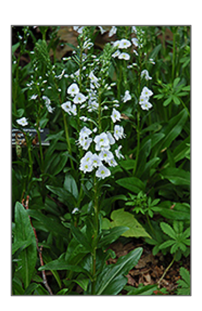
Gentian Speedwell flowers

Gentian Speedwell has masses of beautiful spikes of sky blue flowers rising above the foliage in late spring, which are most effective when planted in groupings. The flowers are excellent for cutting. Its glossy narrow leaves remain emerald green in colour throughout the year.