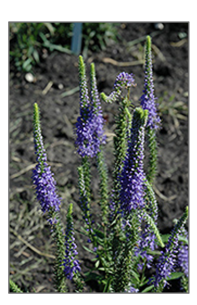
Blue Candles Speedwell flowers

Blue Candles Speedwell has masses of beautiful spikes of blue flowers rising above the foliage from early to mid summer, which are most effective when planted in groupings. The flowers are excellent for cutting. Its narrow leaves remain dark green in colour throughout the season.