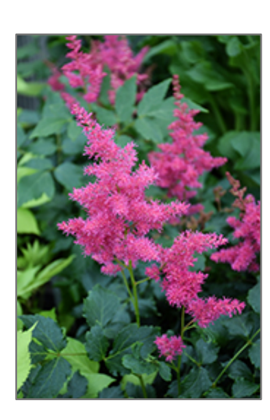
Younique Ruby Red Astilbe flowers

Feathery ruby red plumes, rise above dense foliage; best in a shady spot with dappled light; prefers moisture so water regularly for abundant flowers and nice foliage; perfect for mixed containers; plume heads can be left for winter interest