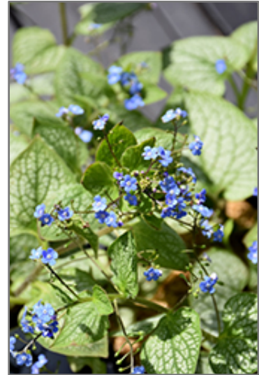
Jack of Diamonds Bugloss flowers

Jack of Diamonds Bugloss is recommended for the following landscape applications;