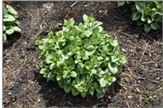
Jack of Diamonds Bugloss

Jack of Diamonds Bugloss will grow to be about 14 inches tall at maturity, with a spread of 30 inches. When grown in masses or used as a bedding plant, individual plants should be spaced approximately 28 inches apart. It grows at a medium rate, and under ideal conditions can be expected to live for approximately 10 years. As an herbaceous perennial, this plant will usually die back to the crown each winter, and will regrow from the base each spring. Be careful not to disturb the crown in late winter when it may not be readily seen!