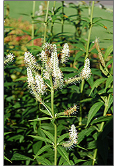
Culver's Root flowers