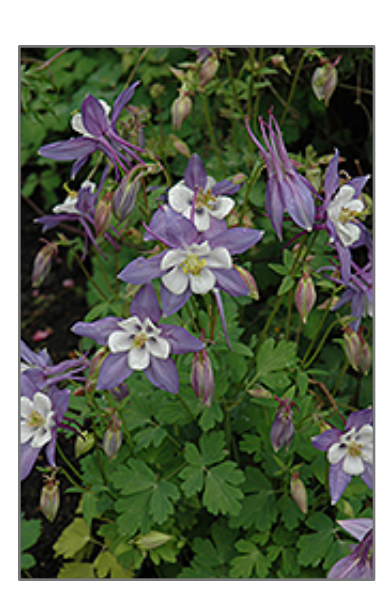
McKana Blue Columbine flowers

With striking bonnet-like flowers in bicolor mixes of blue with other bright colors, this giant columbine is stately in the garden; great for naturalizing areas and attracting wildlife