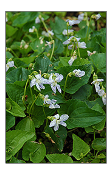
Freckles Violet flowers

Freckles Violet features delicate white flowers with blue spots at the ends of the stems from early spring to mid summer. Its tomentose heart-shaped leaves remain green in colour throughout the season. The brick red stems are very colorful and add to the overall interest of the plant.