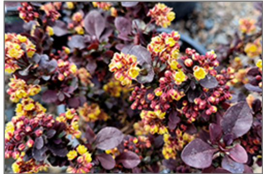
Concorde Japanese Barberry flowers

Concorde Japanese Barberry makes a fine choice for the outdoor landscape, but it is also well-suited for use in outdoor pots and containers. It is often used as a 'filler' in the 'spiller-thriller-filler' container combination, providing a mass of flowers and foliage against which the thriller plants stand out. Note that when grown in a container, it may not perform exactly as indicated on the tag - this is to be expected. Also note that when growing plants in outdoor containers and baskets, they may require more frequent waterings than they would in the yard or garden. Be aware that in our climate, most plants cannot be expected to survive the winter if left in containers outdoors, and this plant is no exception. Contact our experts for more information on how to protect it over the winter months.